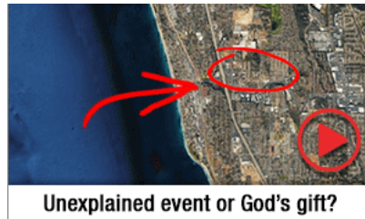
Unexplained event or God's gift?

place in Wisconsin where activists are working to generate public and legislative attention to a grassroots bill, the Consumer Choice and Wellness Act. The clock is ticking on this issue -- the bill must pass by April 2012 or it dies.